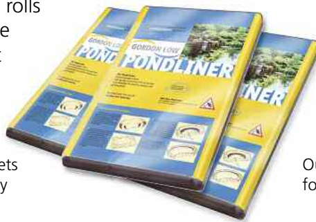
PVC pre-packed sheets for open shelf display

The full range of rolls and pre-packs are available on next day delivery.