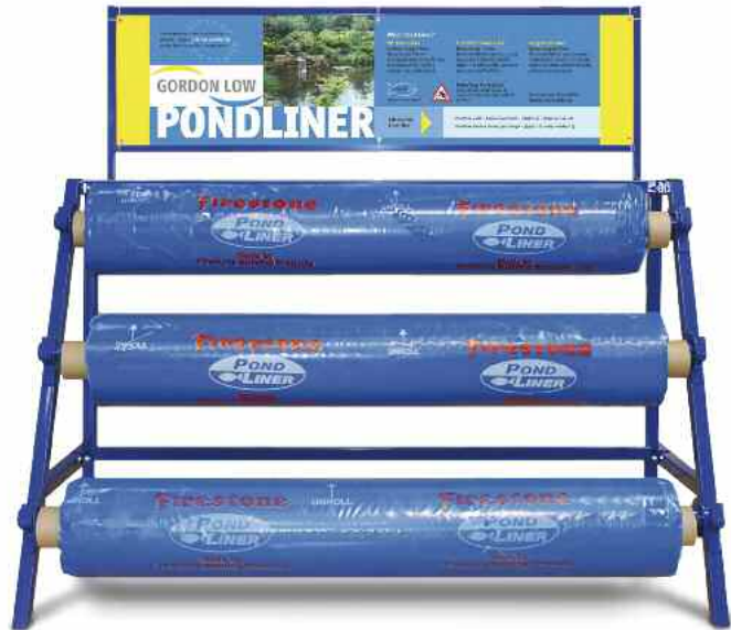
Large Roll Stand with three full width rolls of 30.48m (100') Firestone PondGard.