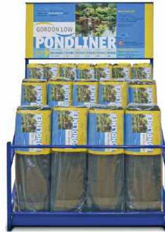
Pre-pack stand loaded with a selection of Greenseal pond liners.

The table below lists a small selection of available sizes from our range. Our largest sheet in one section is 1800m 2 .