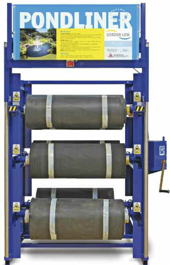
SafeLoad Mechanical Roll Stand stocked with six rolls of half width Firestone PondGard.

Firestone Building Products follow stringent quality control guidelines. The company's EPDM manufacturing facilities have received ISO 9002 certification for their total quality management principles and ISO 14001 certification for their environmental management system. Firestone PondGard is guaranteed to be compatible with aquatic life in accordance with testing reports published by the Water Research Centre.