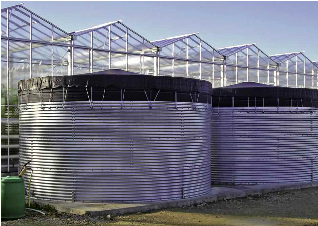
Rainwater run-off collection tanks installed by irrigation specialists Evenproducts.