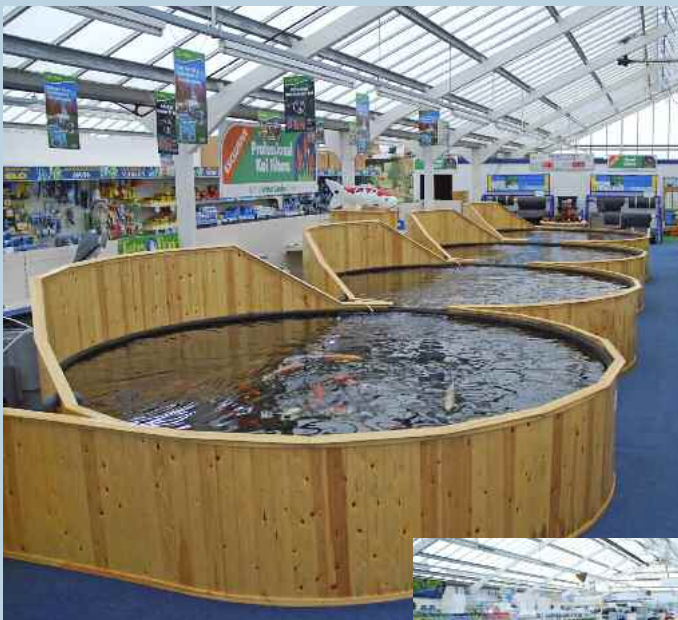
Wood panelling provides a pleasing finish to the koi vats whilst pumps and filtration equipment is discretely screened (right).