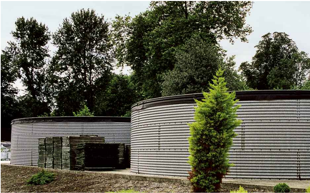
These two 36/3 200,000 litre capacity tanks are used for nursery irrigation.